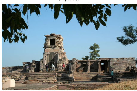
Ruins of Gupta Temple